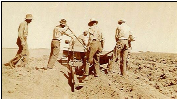
Irrigation Ditch Construction

In addition to these small individual irrigation systems, a group of farmers around Fort Belknap in Montana came together to build a diversion dam made out of earth and rocks that would provide additional water for their farms. Collective irrigation efforts were more successful. Other small dams soon followed, and before long, a dozen were spread out along both the Milk and St. Mary Rivers. By the early 1900s, 35,000 acres in the area were being irrigated to grow grains, vegetables and pastureland for livestock. 11 Systems of irrigation evolved and expanded from simple dams, ditches and flood irrigation, to longer, more extensive canals and pipes as more water could be controlled and stored in dams.